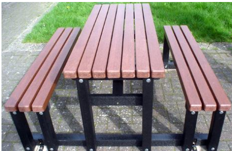
6A) 6-8 impaired walking spaces

Wheelchair provision is already incorporated.