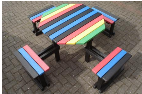
6B) 8 impaired walking spaces