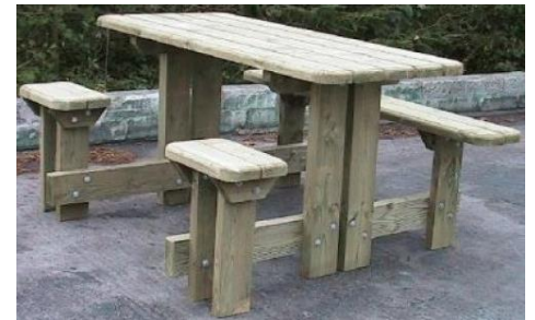
6C) A wheelchair space, plus 2 Impaired walking spaces & space for 3-4 normal access

Any comment you wish to add with regards to the paving and seating: